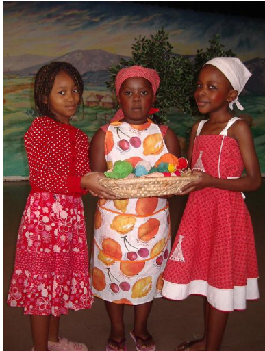
'Ten ripe mangoes' (2W) 'Little Red Riding Hood' (Drama Club)